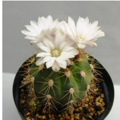
G. chacoense STO 990 Charagua - San Antonio del Parapeti, Santa Cruz, Bolivia (Amerhauser seed)