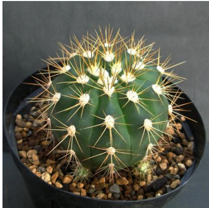
G. chacoense STO 990 Charagua - San Antonio del Parapeti, Santa Cruz, Bolivia (Amerhauser seed)