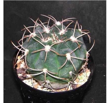
G. mazanense STO 124 Mazan, La Rioja, Arg (Mesa.seed.469.81)