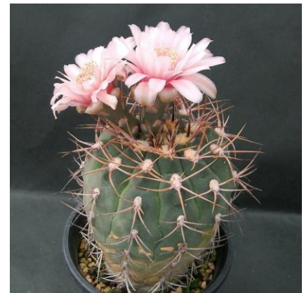
G. hossei (ex) Haage (Piltz seed 2545)