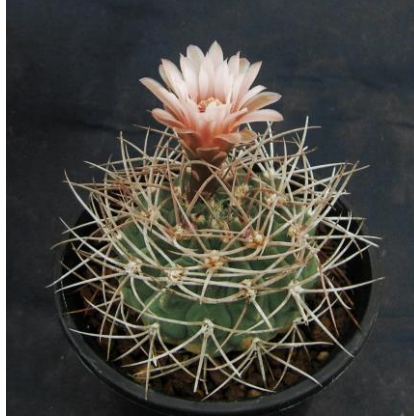
G. hossei P 30 Quebrada de Cebila, La Rioja, Arg. ,1000m (Piltz seed 4200)