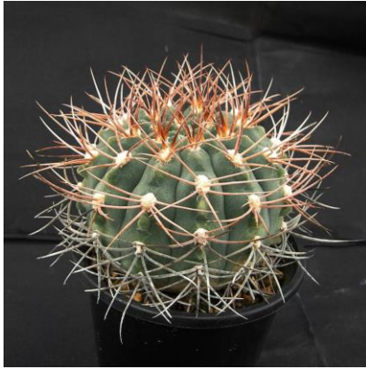
G. hossei P 30 Quebrada de Cebila, La Rioja, Arg. ,1000m (Piltz seed 4200)