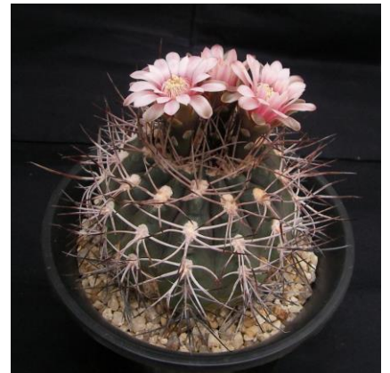
G. mazanense v. ferox ( Winter seed )