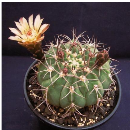
G. mazanense v. ferox P 30A ( Piltz seed 4201 )