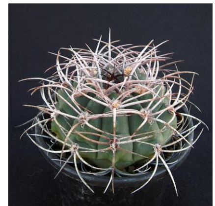
G. hossei v. longispinum LF 35 Estancia Mazan, Catamarca, Arg. (ex) Eden