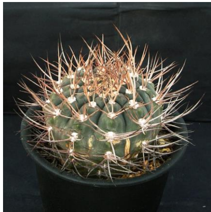
G. mazanense v. ferox ( Piltz seed )