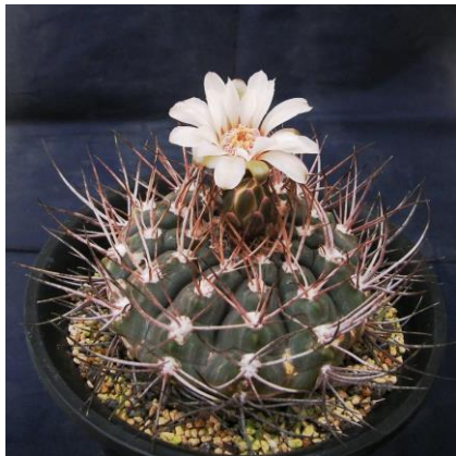
G. mazanense v. ferox ( Piltz seed )