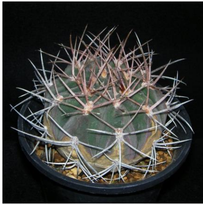
G. mazanense v. ferox LB 1271 east Mazan, La Rioja, Arg. (ex) Eden