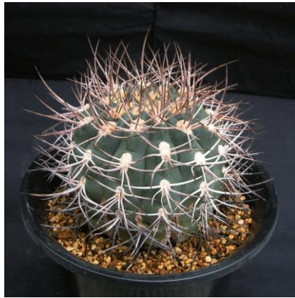
G. mazanense v. ferox ( Winter seed )