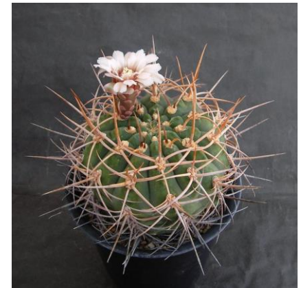
G. hossei v. breviflorum (ex) Eden