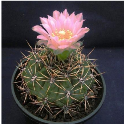
G. achirasense LB 330 La Punilla, San Luis, Arg. (ex)Eden