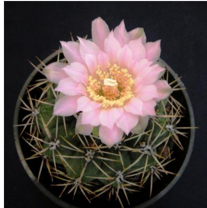
G. achirasense LB 330 La Punilla, San Luis, Arg. (ex)Eden