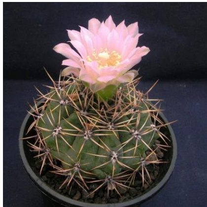
G. achirasense LB 330 La Punilla, San Luis, Arg. (ex)Eden