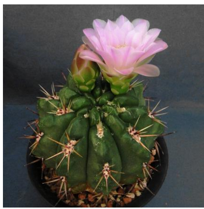
G. monvillei ssp. achirasense (Mesa seed 468.708)