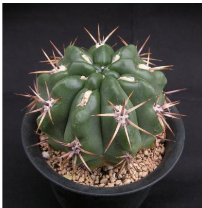
G. monvillei ssp. achirasense (Mesa seed 468.708)