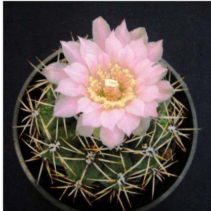
G. achirasense LB 330 La Punilla, San Luis, Arg. (ex)Eden