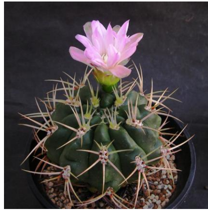
G. brachyanthum GN 77-1184 San Luis, Arg. (Piltz seed 4610)