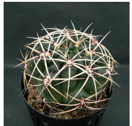
G. brachyanthum LF 7 Suyuque Nuevo, San Luis, Arg. (Bercht seed)