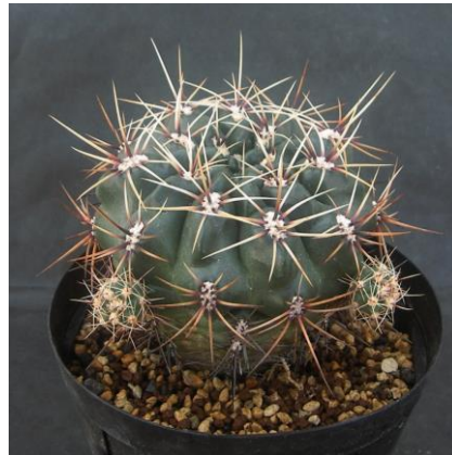
G. brachyanthum LB 1400 east of Intihuasi, San Luis, Arg. (Bercht seed)