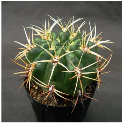
G. brachyanthum GN 77-1184 San Luis, Arg. (Piltz seed 4610)