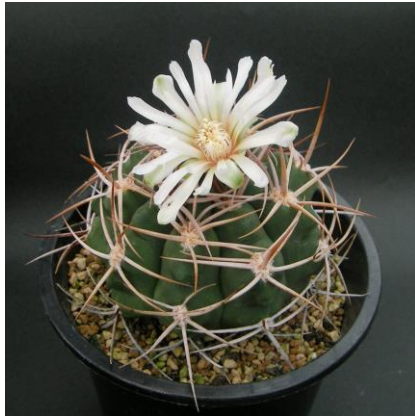
G. mostii ssp. ferocior STO 498-1 west of Las Charas, Cordoba , Arg.