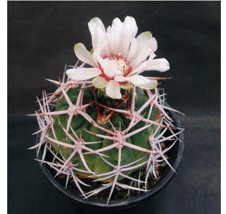
G. mostii ssp. ferocior STO 866 Agua de Ramon, Cordoba , Arg. (Mesa seed 468.87)