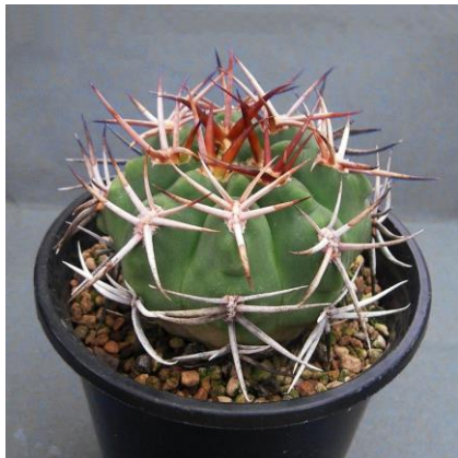
G. mostii ssp. ferocior STO 866 Agua de Ramon, Cordoba , Arg. (Mesa seed 468.87)