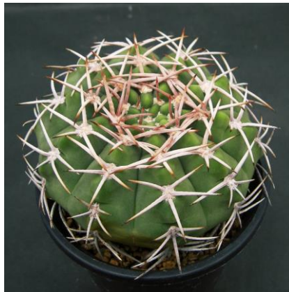
G. ferox GN 395-1307 South-west. Villa de Soto, Cordoba , Arg. (Piltz seed 3764)