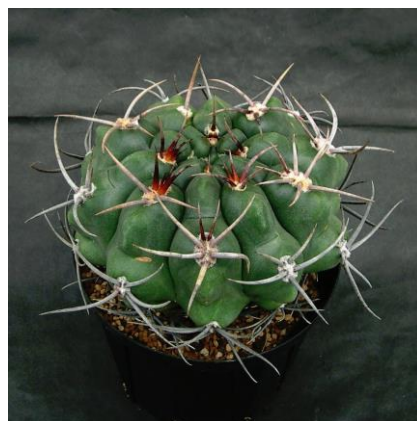
G. mostii v. kurtzianum