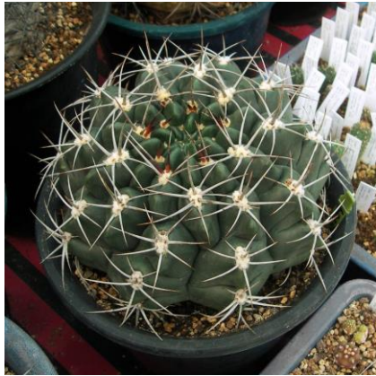
G. mostii v. kurtzianum P 84 La Falda Cordoba, Arg. (Succseed seed 448)