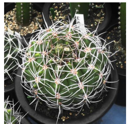
G. mostii v. kurtzianum