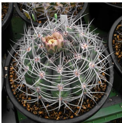
G. mostii v. kurtzianum