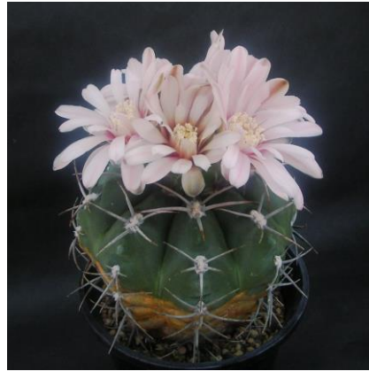
G. mostii v. kurtzianum P 84 La Falda Cordoba, Arg. (Succseed seed 448)