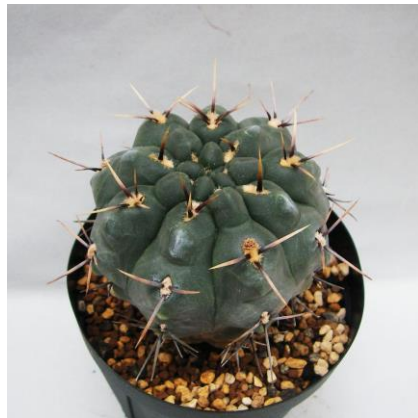
G. borthii ssp. kokori JPR 89-204 Zanjitas , San Luis, Arg. (ex)Eden