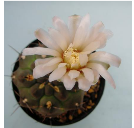
G. borthii ssp. kokori JPR 89-204 Zanjitas , San Luis, Arg. (ex)Eden