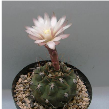
G. borthii ssp. kokori JPR 89-204 Zanjitas , San Luis, Arg. (ex)Eden