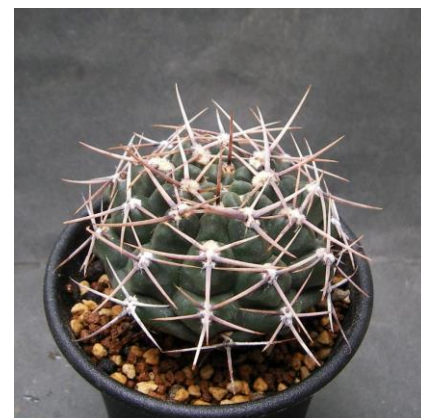
G. strigianum STO 684 (ex) Eden