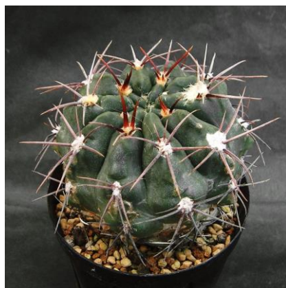
G. strigianum fa. GN 146-374 Loma de Medio, San Luis, Arg. (Piltz seed 4040)