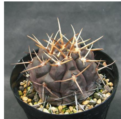
G. strigianum JPR 89-197 Lujan de Cuyo, Mendoza, Arg. (ex) Eden