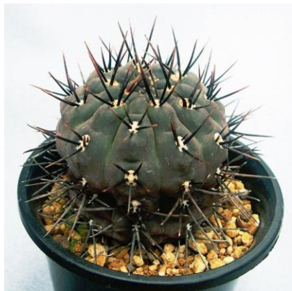
G. strigianum GN 184-561 (ex) Eden