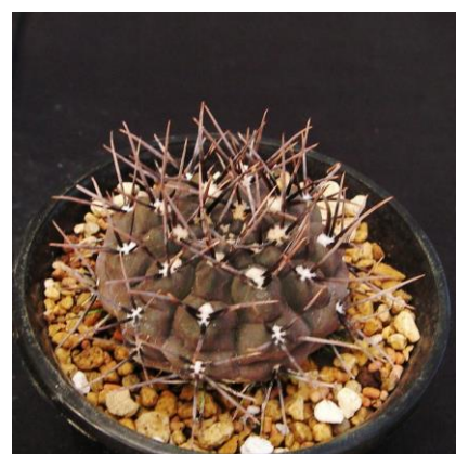
G. strigianum GN 184-561 (ex) Eden