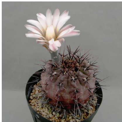
G. strigianum GN 184-561 (ex) Eden