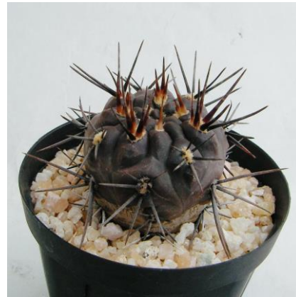
G. strigianum v. herminae JPR 81-182 Punta de Agua, Mendoza, 460m, Arg (ex) Eden.