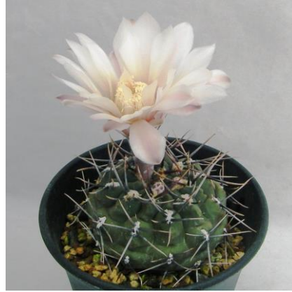
G. strigianum GN 75-380 Alto Pencoso Mosmote, San Luis, Arg. (ex) Eden