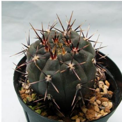
G. strigianum v. herminae JPR 127-351 Los Arboles, Mendoza, 760 m, Arg (ex) Bercht seed 4621(2015)