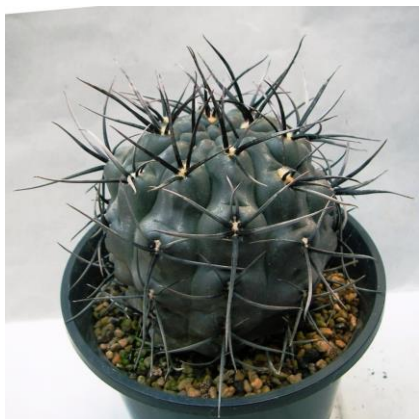
G. strigianum (Koehres seed)