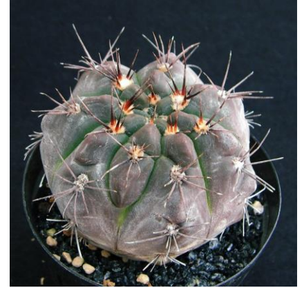
G. strigianum LB 0290 south east of Juan W. Gez., San Luis, Arg. Bercht seed 2288(2008)