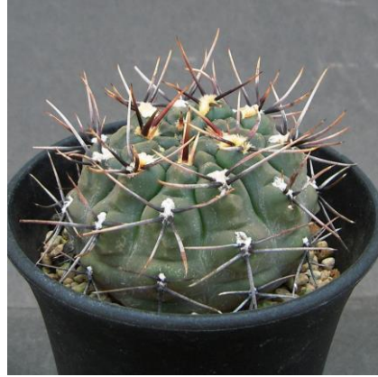
G. strigianum GN 75-380 Alto Pencoso Mosmote, San Luis, Arg. (ex) Eden