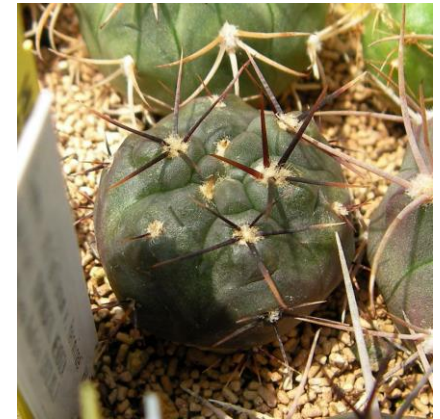
G. strigianum v. herminae HV 729 Tupungato, Mendoza, Arg (ex) Milenaudio