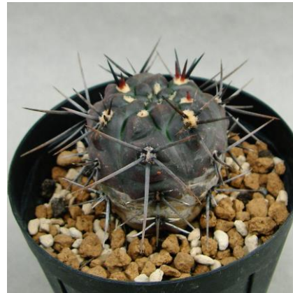
G. strigianum v herminae JPR 81-182 Punta de Agua, Mendoza, 460m, Arg (ex) Eden.