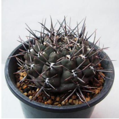
G. strigianum STO 544 Zanjitas, San Luis, 400m, Arg. (ex) Eden