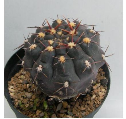
G. strigianum ssp otmari JPR 80-180 Cerro Centinala, San Luis, Arg. (Mesa seed 490.298)