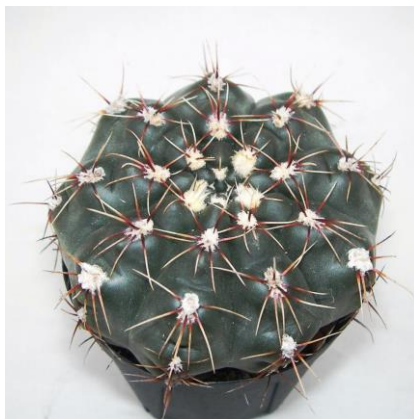
G. amerhauseri STO 229 Tres Cascadas, Codoba, Arg. (Bercht seed)