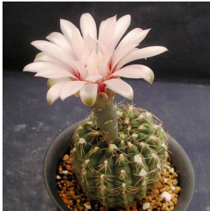
G. altagraciense P119 Villa de Maria, Cordoba, 500m, Arg. (Mesa seed 453.962)

(異名同種) = G. altagraciense : ( アルタグラシエンセ )