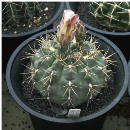
G. altagraciense (Mesa seed 453.96)