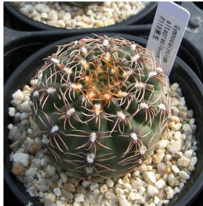
G. altagraciense P119 Villa de Maria, Cordoba, 500m, Arg. (Mesa seed 453.962)