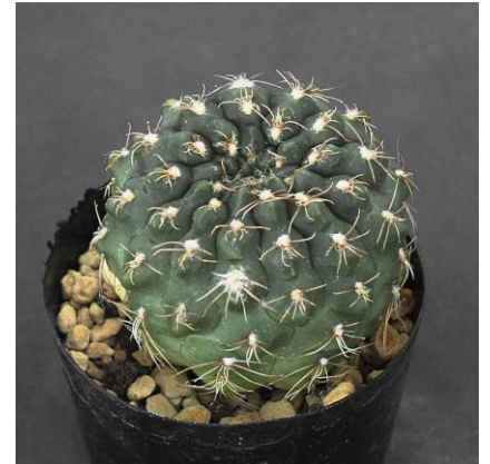
G. altagraciense P119 Villa de Maria, Cordoba, 500m, Arg. (Mesa seed 453.962)