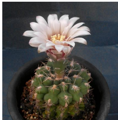
G. altagraciense (ex) Uhlig