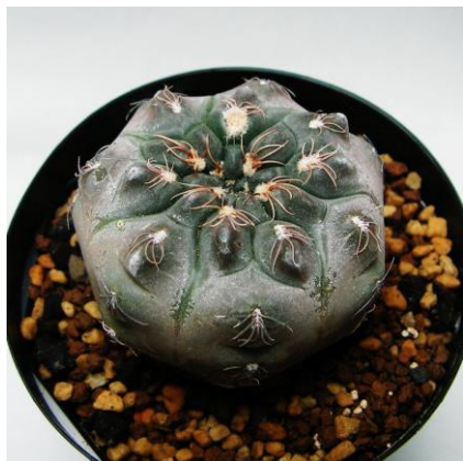
G. morroense LB 326 north of Sierra del Morro, San Luis, Arg. (ex) Eden