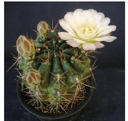
G. gibbosum v. leonense (Mesa seed 467.2)