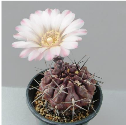
G. chubutense WP 40-50A Sierra Colorado, Rio Negro, ,250-400m, Arg. (Piltz seed 3416)