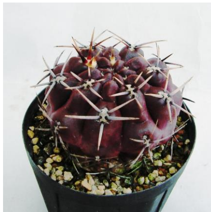
G. chubutense JPR 40-93 Peninsula Valdes, Salinas Grandes, Chubut, 0m, Arg. (ex)Eden