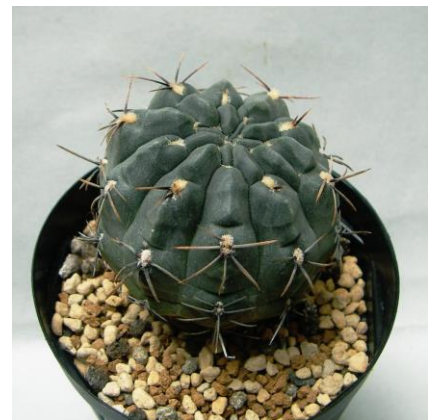
G. chubutense GN 279-921 Lihuel Calel, La Pampa, Arg. (ex)Eden