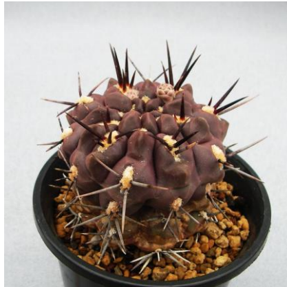
G. chubutense WP 40-50A Sierra Colorado, Rio Negro, ,250-400m, Arg. (Piltz seed 3416)