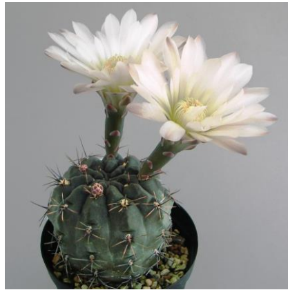
G. chubutense GN 279-921 Lihuel Calel, La Pampa, Arg. (ex)Eden