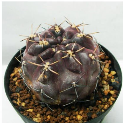
G. chubutense JPR 40-93 Peninsula Valdes, Salinas Grandes, Chubut, 0m, Arg. (ex)Eden