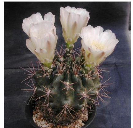
G. gibbosum v. leonense (Mesa seed 467.2)