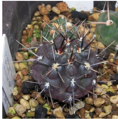
G. gibbosum ssp. radekii JPR 70-157 Barranca de Gualicho, Rio Negro, Arg. 140m (Piltz seed 4624)