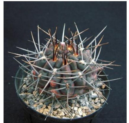
G. gibbosum ssp. radekii JPR 70-157 Barranca de Gualicho, Rio Negro, Arg. 140m (Piltz seed 4624)