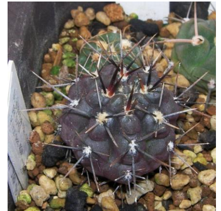
G. gibbosum ssp. radekii JPR 70-157 Barranca de Gualicho, Rio Negro, Arg. 140m (Piltz seed 4624)