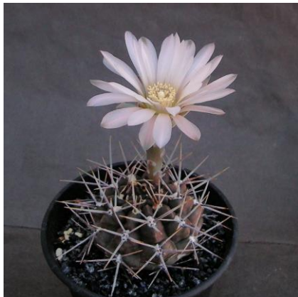
G. gibbosum ssp. radekii JPR 70-157 Barranca de Gualicho, Rio Negro, Arg. 140m (ex)Eden