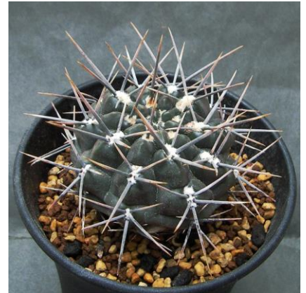
G. gibbosum ssp. radekii JPR 70-157 Barranca de Gualicho, Rio Negro, Arg. 140m (ex)Eden