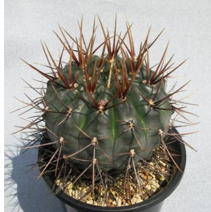
G. gibbosum ssp. radekii JPR 70-157 Barranca de Gualicho, Rio Negro, Arg. 140m (ex)Eden