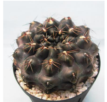
G. erolesii LB 2308 south of Vera, Santa Fe, Arg. (Bercht seed) - skin color in winter -