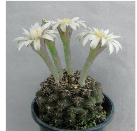
G. schroederianum ssp. boessii (ex) Strigl ( CCB seed CB-090029)