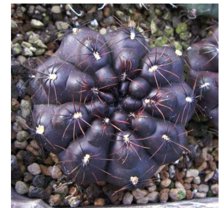
G. schroederianum ssp. boessii Santa Fe, Arg. (Piltz seed 3402) - skin color in winter -