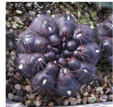
G. schroederianum ssp. boessii Santa Fe, Arg. (Piltz seed 3402)