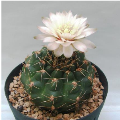
G. gaponii ssp. geyeri GN 376-1260 La Sierrita, Cordoba, Arg. (Piltz seed 4969)