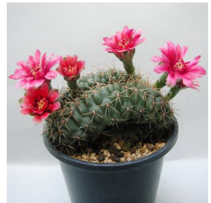
G. x heidiae HV 871 Singuil, Catamarca, Arg. (Piltz seed 4891)-