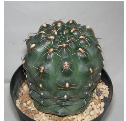
G. x heidiae GN 0925-3028 east of Humaya, Catamarca, Arg. (ex) Eden