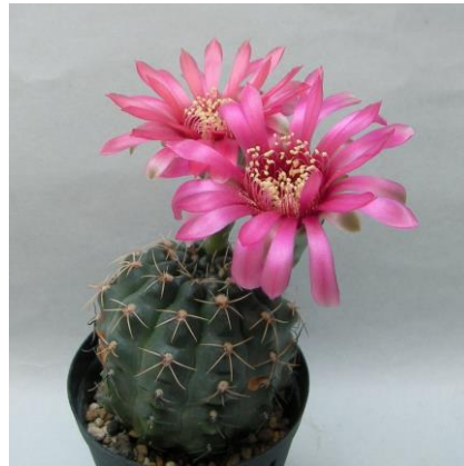
G. x heidiae GN 0925-3028 east of Humaya, Catamarca, Arg. (ex) Eden