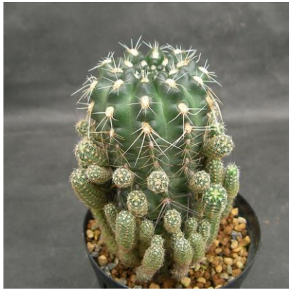
G. andreae v. fechseri P 378 Pampa de San Luis, Cordoba, Arg. (Piltz seed 4317)

= G. andreae v. cylindrical : (黄蛇丸 (変種) シリンドリカル)