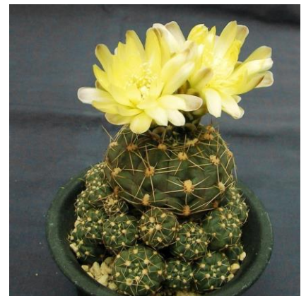
G. andreae v. cylindrical