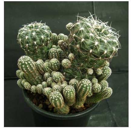
G. doppianum (Mesa seed 464.03)