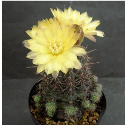
G. andreae v. grandiflorum (Rowland seed)