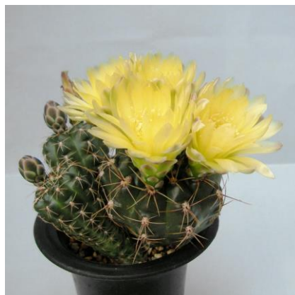
G. andreae v. grandiflorum (ex) Eden