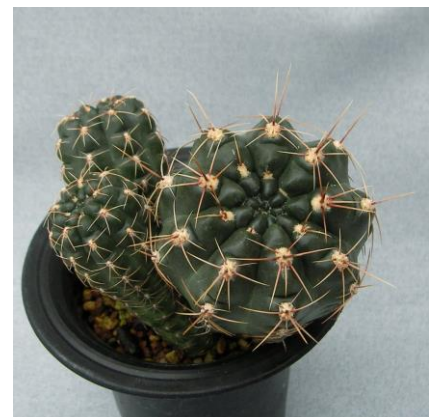
G. andreae v. grandiflorum (ex) Eden