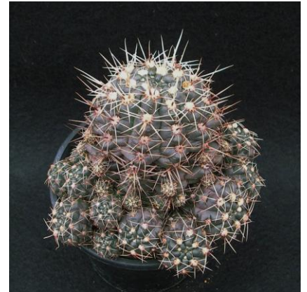
G. andreae v. grandiflorum (Rowland seed)