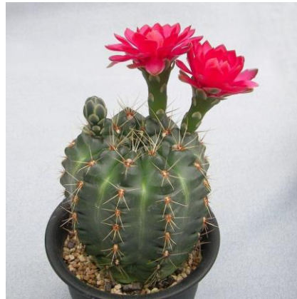
G. baldianum LB 1243 El Rosario Catamarca 1150m, Arg. (ex)Eden