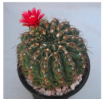
G. baldianum (long spines)