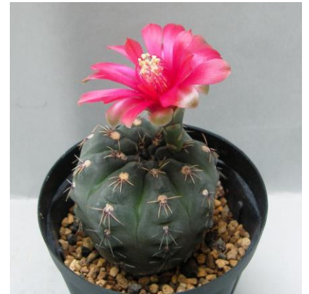
G. baldianum VS 129 Cuesta El Portezuelo, Catamarca, Arg. (ex)Eden