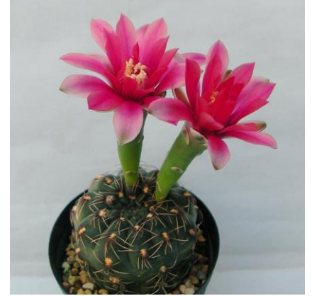
G. baldianum STO 1274 between El Alto and Ancasti, 1900 m, Catamarca, Arg. (Amerhauser seed)