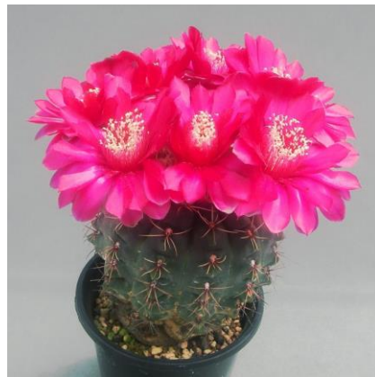
G. baldianum LB 1243 El Rosario Catamarca 1150m, Arg. (ex)Eden