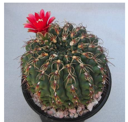
G. baldianum (claw-like spines)