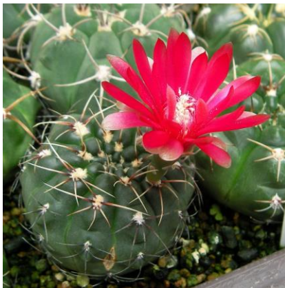
G. venturianum v. crassispinum (Jecminek seed 0-2931)