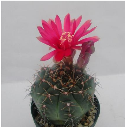
G. venturianum v. curvispinum (Jecminek seed 0-2933)