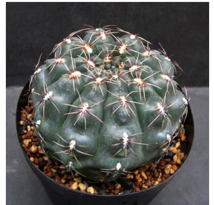
G. venturianum v. curvispinum (Jecminek seed 0-2933)