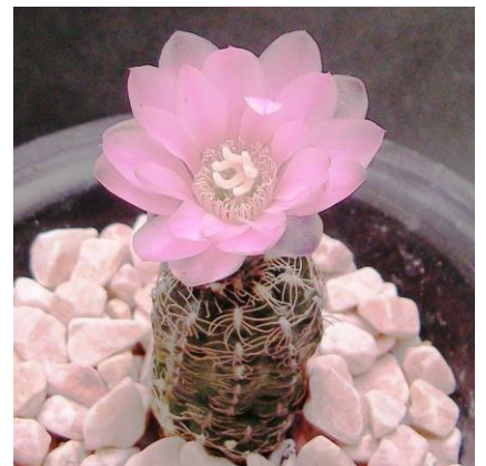
G. bruchii GN 280-187 Cordoba, Arg. (ex)Eden