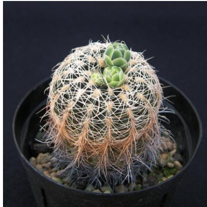
G. bruchii P 200 East of Copina, Cordoba, 1250m, Arg. (ex) Milenaudio