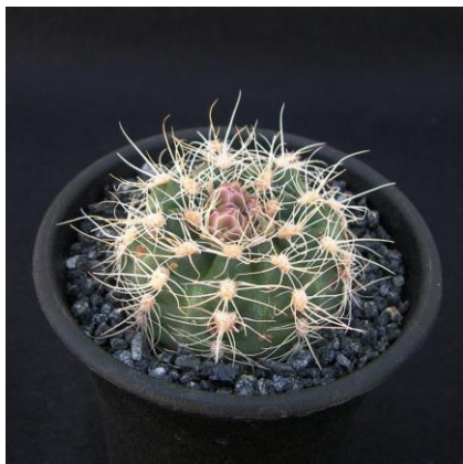
G. bruchii GN 232-718 Calamuchita, Cordoba, Arg. (Piltz seed 3585)