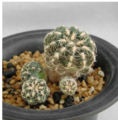
G. bruchii GN 280-187 Cordoba, Arg. (ex)Eden