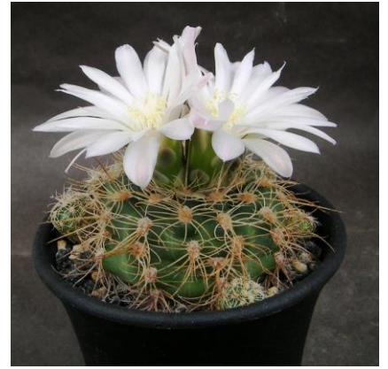
G. bruchii GN 232-718 Calamuchita, Cordoba, Arg. (Piltz seed 3585)