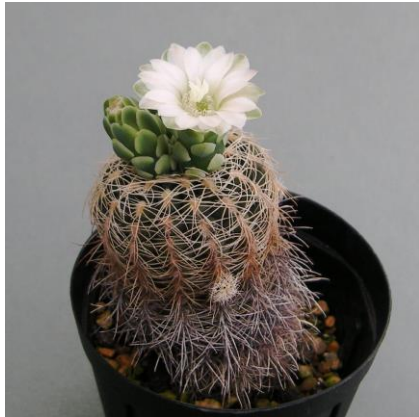
G. bruchii P 200 East of Copina, Cordoba, 1250m, Arg. (ex) Milenaudio

Synonyms : = G. bruchii [G. Charles] : ( 羅星丸 ) (異名同種)