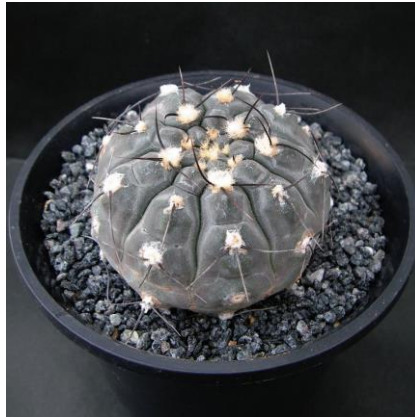
G. berchtii VS 161 Chanares, San Luis, 800m, Arg. (ex) Eden