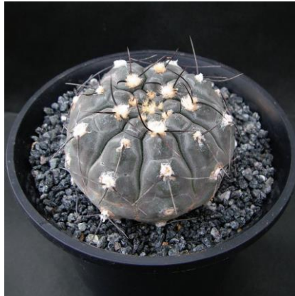
G. berchtii VS 161 Chanares, San Luis, 800m, Arg. (Koehres seed)