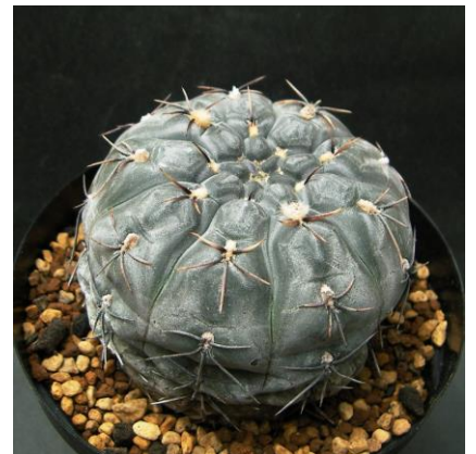
G. berchtii STO 1596 (ex)Eden