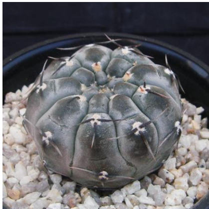
G. berchtii VS 161 Chanares, San Luis, 800m, Arg. (ex) Eden