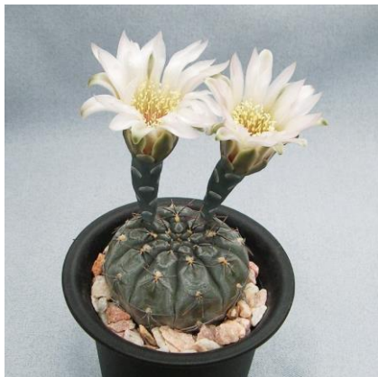
G. berchtii STO 1596 (ex)Eden