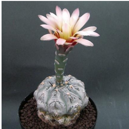
G. berchtii VS 161 Chanares, San Luis, 800m, Arg. (Koehres seed)