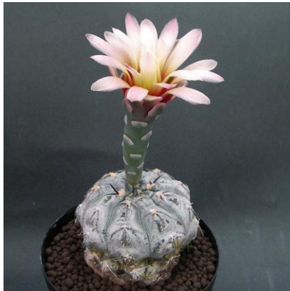
G. berchtii VS 161 Chanares, San Luis, 800m, Arg. (ex) Eden