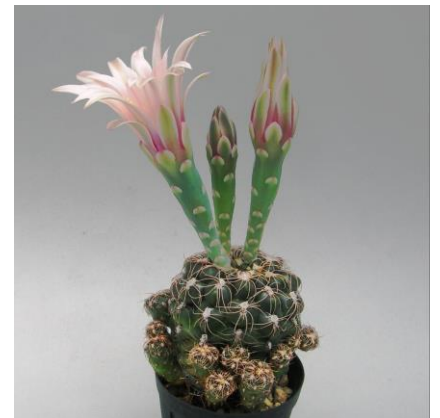
G. parvulum (唐子丸)