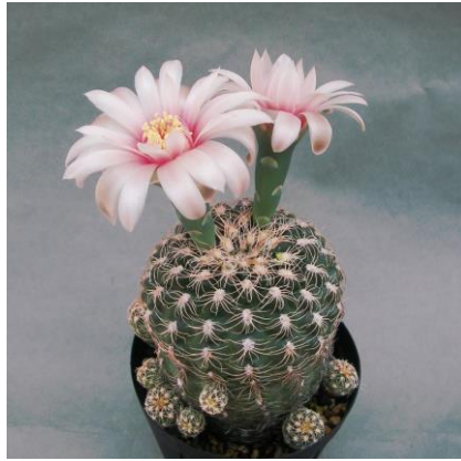
G. parvulum P 109B Villa Cura Borochoero, Cordoba, Arg. (ex) Eden