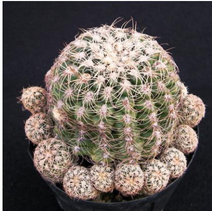
G. parvulum P 109B Villa Cura Borochoero, Cordoba, Arg. (ex) Eden

Synonyms : ≒ G. calochlorum [G. Charles] : ( カラクロラム、火星丸) (異名同種) = G. calochlorum v. proriferum : (プロリフェラム、唐子丸)