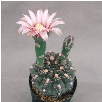
G. parvulum BKS 171 Cienaga de Allende, Cordoba, Arg. (Piltz seed 3424)