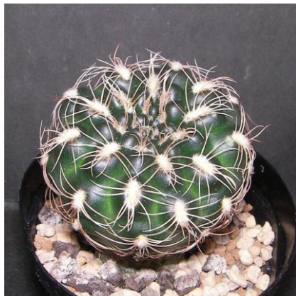
G. parvulum HV 664 Panaholma, Cordoba, Arg. (Bercht seed)