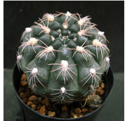
G. parvulum BKS 171 Cienaga de Allende, Cordoba, Arg. (Piltz seed 3424)