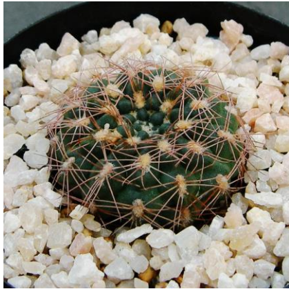
G. parvulum ssp. huettneri Tom 268.2, 4 km N of San Pedro Norte Sobremonte, Cordoba, Arg (ex) Eden

Synonyms : \cong G. calochlorum [G. Charles] : ( カロクロラム、火星丸 ) (異名同種)