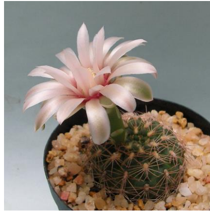
G. parvulum ssp. huettneri Tom 268.2, 4 km N of San Pedro Norte Sobremonte, Cordoba, Arg (ex) Eden