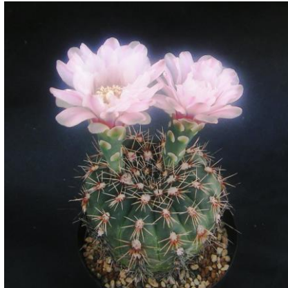
G. erinaceum STO 390 Villa de Soto - Ongamira, Cordoba, , Arg. (Piltz.seed.3561)