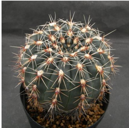
G. erinaceum STO 390 Villa de Soto - Ongamira, Cordoba, , Arg. (Piltz.seed.3561)

Synonyms : = G. erinaceum [G. Charles] : ( エリナセウム) (異名同種)