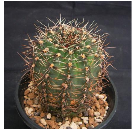
G. erinaceum WR 726B Sauce Punco, Cordoba, 1050 m, Arg