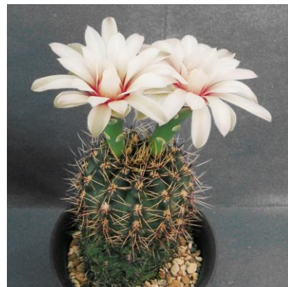
G. erinaceum (Mesa.seed.464.04)