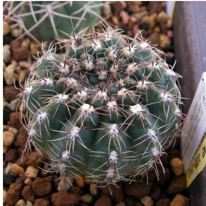
G. erinaceum WP-108-143 Canada de Rio Pinto, Cordoba, 750m, Arg. (Piltz.seed.4043)