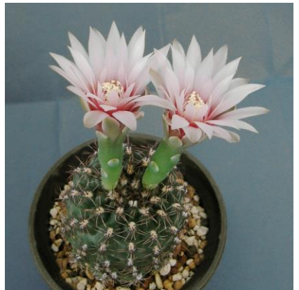
G. erinaceum WP-108-143 Canada de Rio Pinto, Cordoba, 750m, Arg. (Piltz.seed.4043)