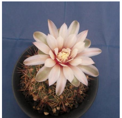
G. erinaceum (Mesa.seed.464.04)