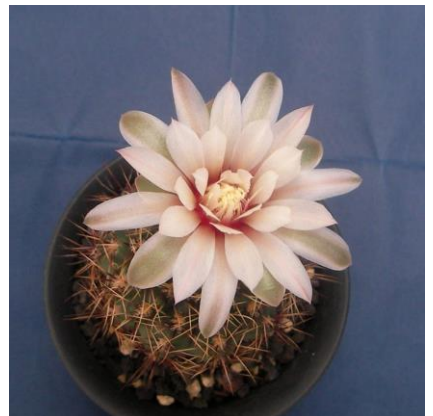
G. erinaceum (Mesa.seed.464.04)