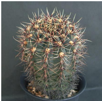
G. erinaceum (Mesa.seed.464.04)