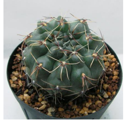
G. robustum KP 306A E of Quilino, Cordoba, Arg. (CCB seed CB-012155)