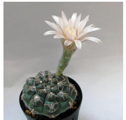
G. robustum VS 139 Quilino, Cordoba, Arg. 600m (Piltz seed 5215)