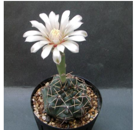
G. robustum BKN 83A east of Quilino, Cordoba, 447m, Arg.