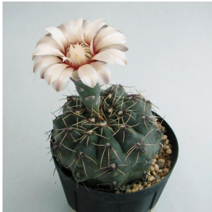
G. robustum KP 306A E of Quilino, Cordoba, Arg. (CCB seed CB-012155)