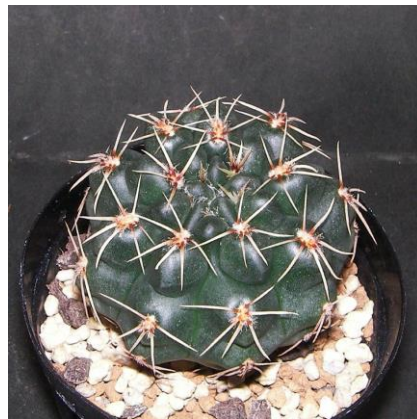
G. robustum BKN 83A east of Quilino, Cordoba, 447m, Arg. (Dohnalik seed DS-010631)