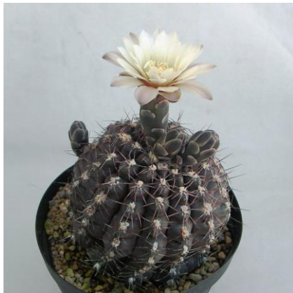
G. nataliae STO 868 between Cortadera and Ojo de Aqua, San Luis, Arg. (ex)Eden