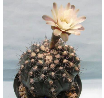
G. nataliae STO 868 between Cortadera and Ojo de Aqua, San Luis, Arg. (ex)Eden