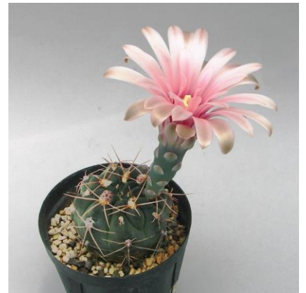
G. nataliae MM 650 route 2, near La Vertiente, San Luis Arg.