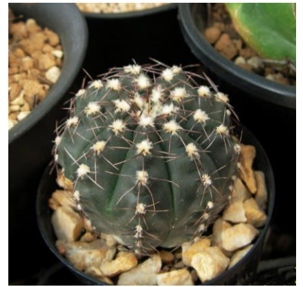
G. nataliae STO 868 between Cortadera and Ojo de Aqua, San Luis, Arg. (ex)Eden