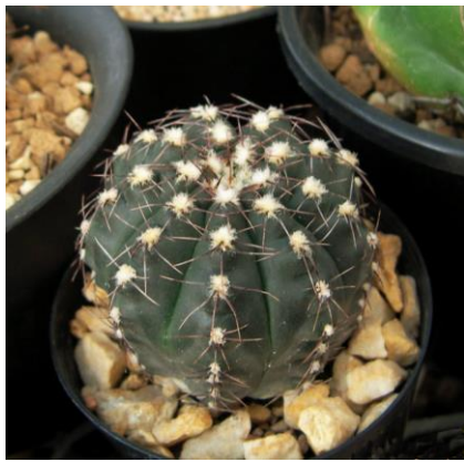
G. nataliae STO 868 between Cortadera and Ojo de Aqua, San Luis, Arg. (ex)Eden