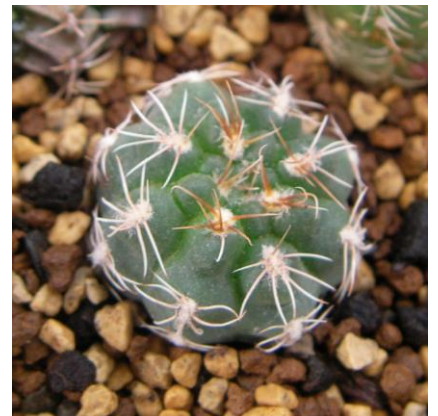
G. nataliae MM 743 Route 41, north Las Chacras, San Luis, Arg.