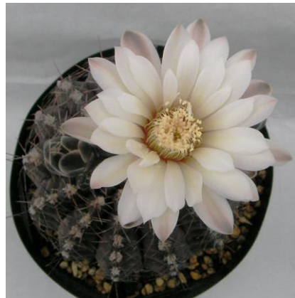
G. nataliae STO 868 between Cortadera and Ojo de Aqua, San Luis, Arg. (ex)Eden