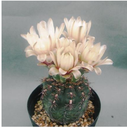
G. leptanthum STO 279-2 San Martin-DeanFunes, Cerro Colorado, Cordoba, Arg. (ex) Eden