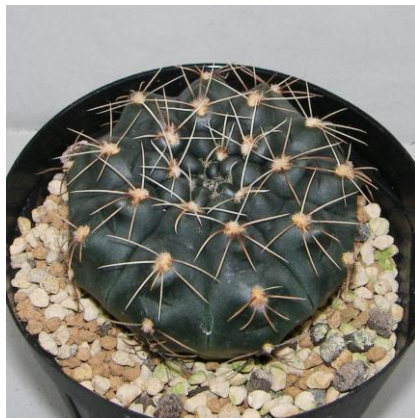
G. leptanthum STO 278 San Martin - Dean Funes near Santa Elena, Córdoba, Arg. (Mesa seed 483.5)