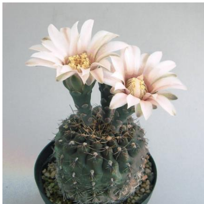
G. leptanthum JL37, Balbuena, Cordoba, 600m, Arg. (Piltz seed 3191)