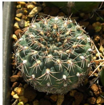
G. leptanthum JL37, Balbuena, Cordoba, 600m, Arg. (Piltz seed 3191)