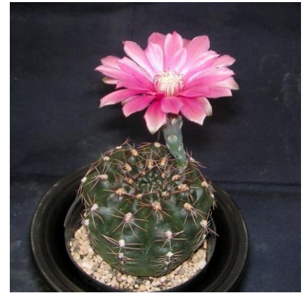
G. terweemeanum STR 166-03 (origin) Franz Strigl (ex) Eden