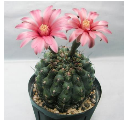
G. terweemeanum (ex) Eden