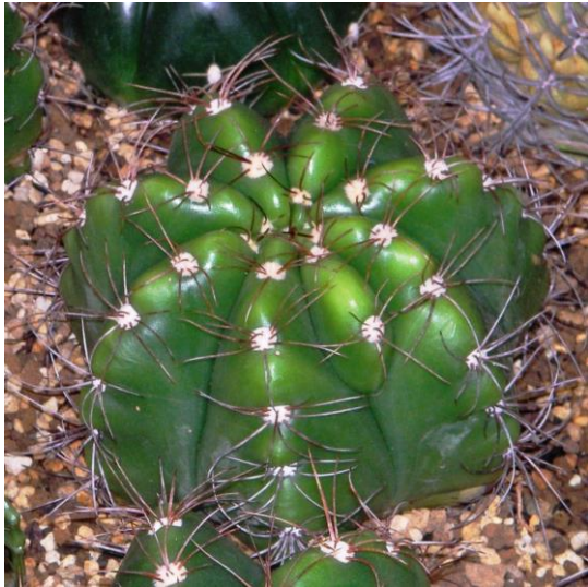
G. fleischerianum ( 蛇紋玉 )