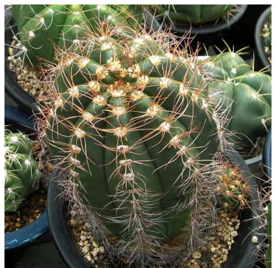
G. fleischerianum ( 蛇紋玉 )