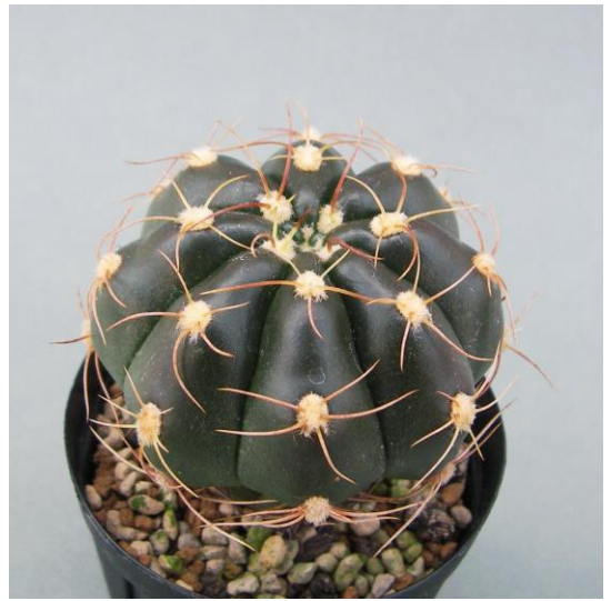
G. fleischerianum HU 304 ( 蛇紋玉 ) color in winter