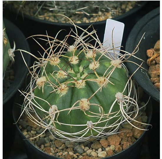
G. fleischerianum ( 蛇紋玉 )