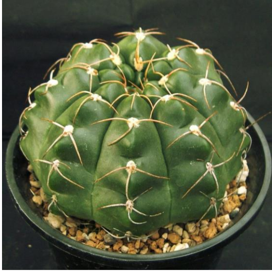
G. paraguayense aff. (モンビー玉 (雲竜))