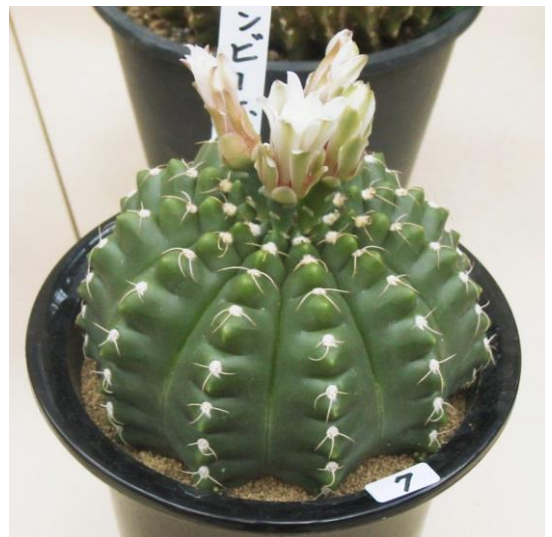
G. paraguayense aff. (モンビー玉)