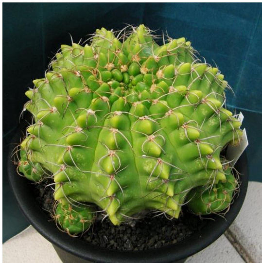
G. paraguayense aff. (モンビー玉)