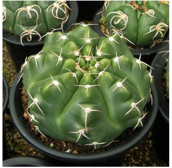
G. paraguayense aff. (モンビー玉)