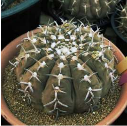
G. bodenbenderianum ( 守殿玉 )