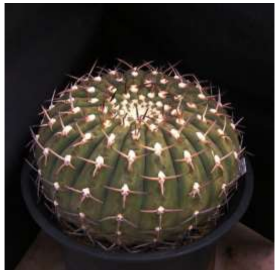
G. bodenbenderianum ( 守殿玉 )