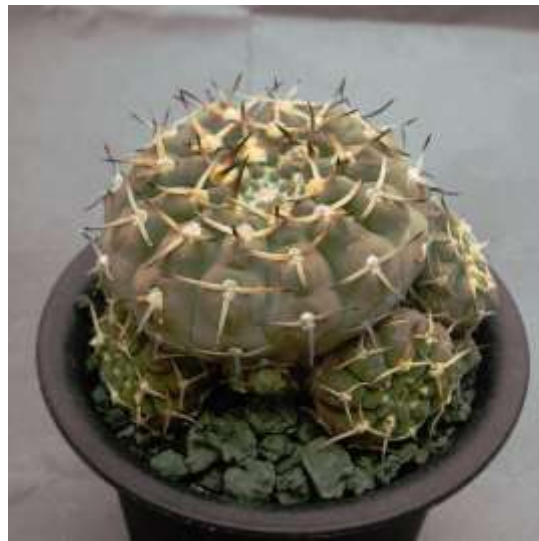
G. bodenbenderianum ( 守殿玉 )