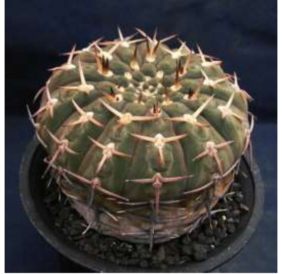
G. bodenbenderianum ( 守殿玉 )