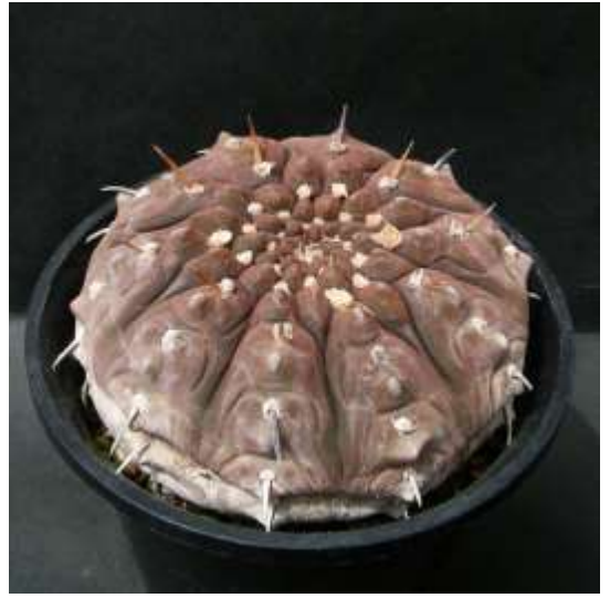
G. bodenbenderianum ( 守殿玉 )