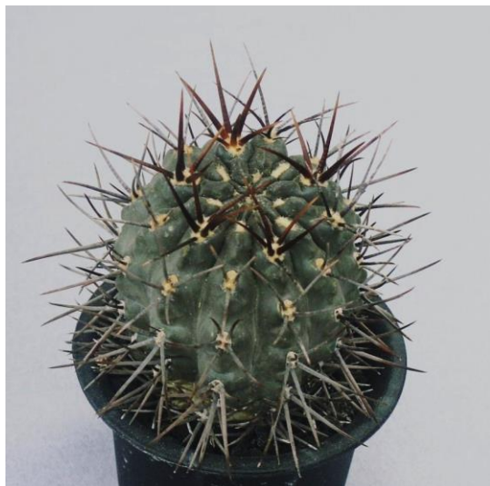
G. gibbosum v. nigrum (九紋竜・ニグラム)