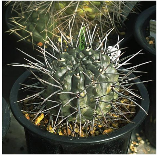
G. gibbosum v. nigrum (九紋竜・ニグラム)