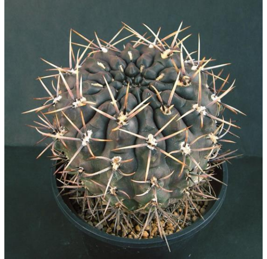
G. gibbosum v. brachypetalum (鬼胆丸)