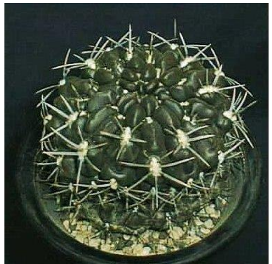
G. gibbosum v. nigrum (九紋竜・ニグラム)