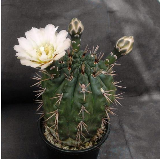
G. gibbosum v. brachypetalum (鬼胆丸)

(= G. gibbosum v. nigrum : (九紋竜 (変種) ニグラム)