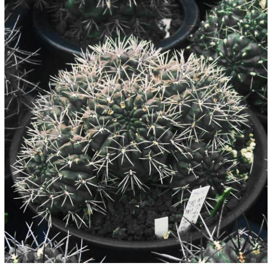
G. gibbosum v. nigrum (九紋竜・ニグラム)