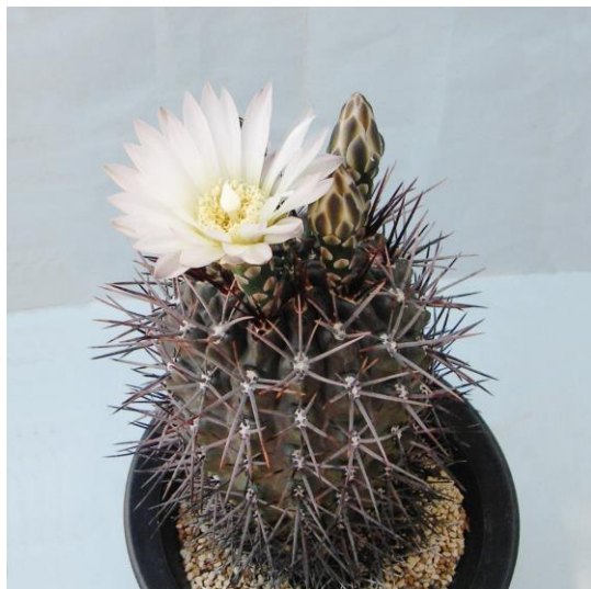
G. gibbosum v. nigrum (九紋竜・ニグラム)