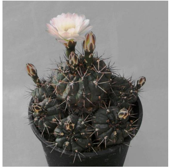
G. gibbosum v. nigrum (九紋竜・ニグラム)