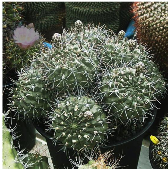
G. gibbosum v. nigrum (九紋竜・ニグラム)