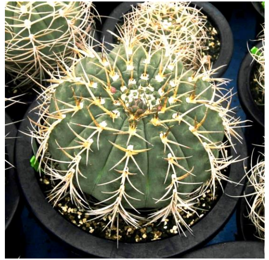
G. cardenasianum (光琳玉)