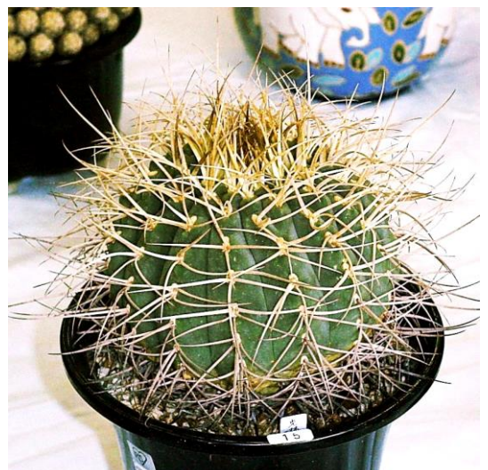
G. cardenasianum (光琳玉)