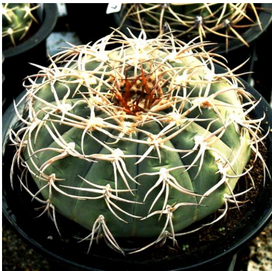
G. cardenasianum (光琳玉)