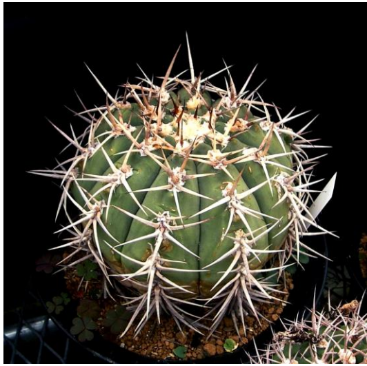
G. cardenasianum (光琳玉(直刺))