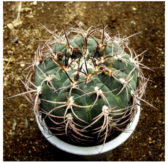
G. cardenasianum (光琳玉(亀甲))