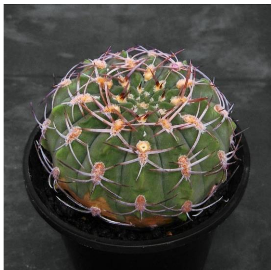
G. catamarcense aff. (五大州 (正伝五大州) )