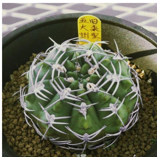
G. catamarcense aff. (五大州 (旧来五大州) )