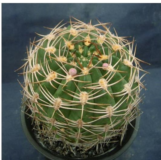
G. catamarcense aff. (五大州)