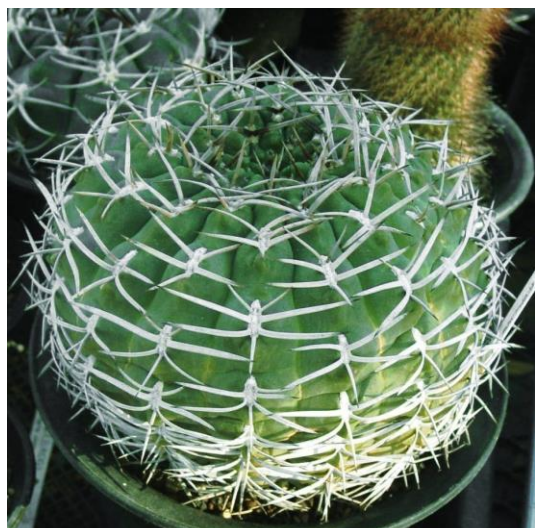
G. catamarcense aff. (五大州 (正伝五大州) )