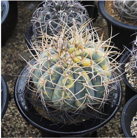
G. cardenasianum varieg. (光琳錦)