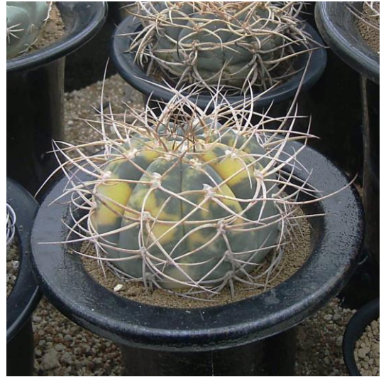
G. cardenasianum varieg. (光琳錦)