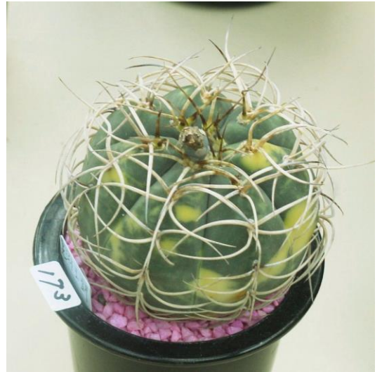
G. cardenasianum varieg. (光琳錦)