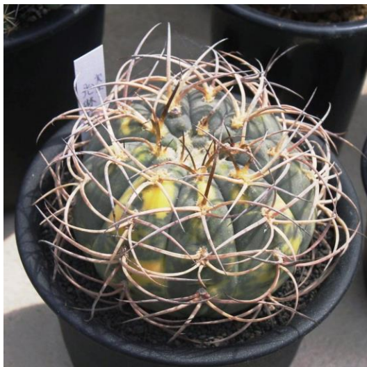
G. cardenasianum varieg. (光琳錦)