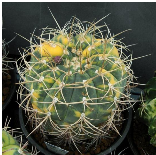
G. cardenasianum varieg. (光琳錦)