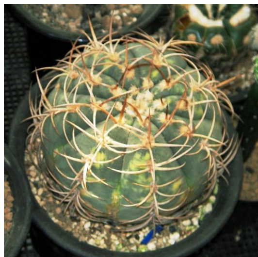
G. cardenasianum varieg. (光琳錦)