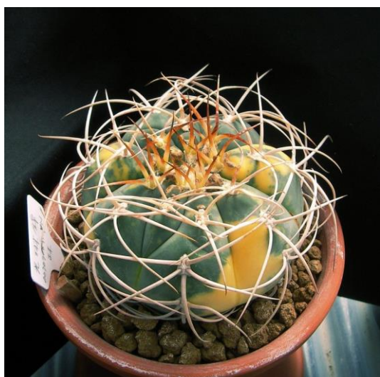
G. cardenasianum varieg. (光琳錦)