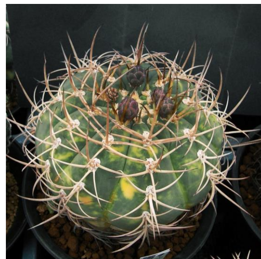
G. cardenasianum varieg. (光琳錦)