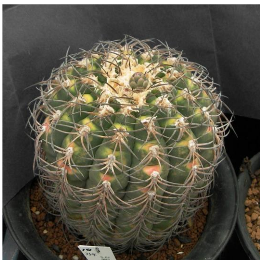
G. spegazzinii varieg. (天平錦)