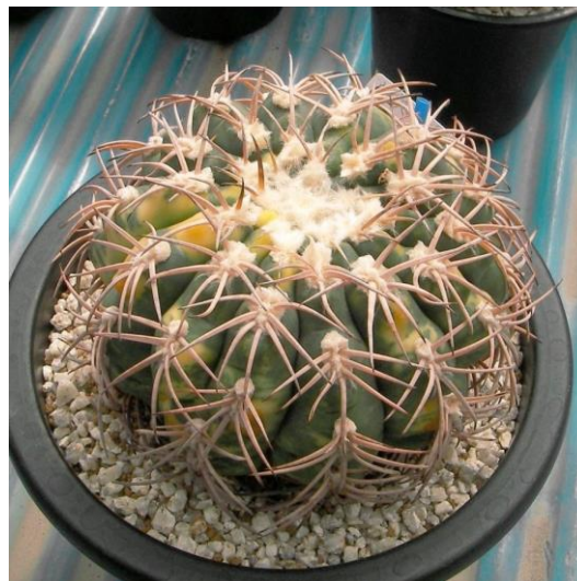
G. spegazzinii varieg. (天平錦)