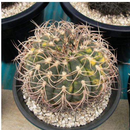
G. spegazzinii varieg. (天平錦)