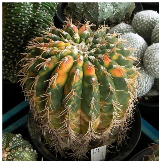
G. spegazzinii varieg. (天平錦)