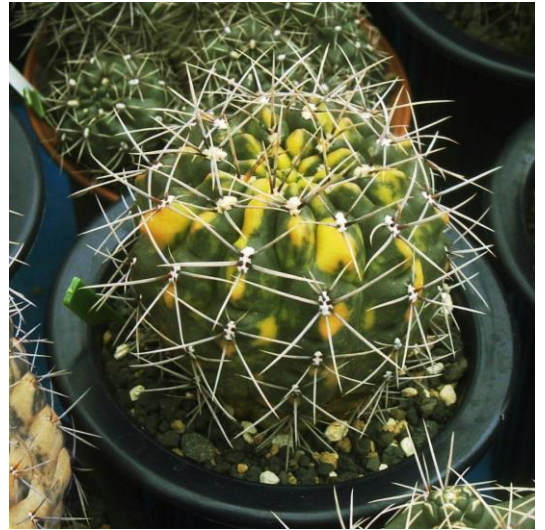
G. gibbosum varieg. (九紋竜錦)