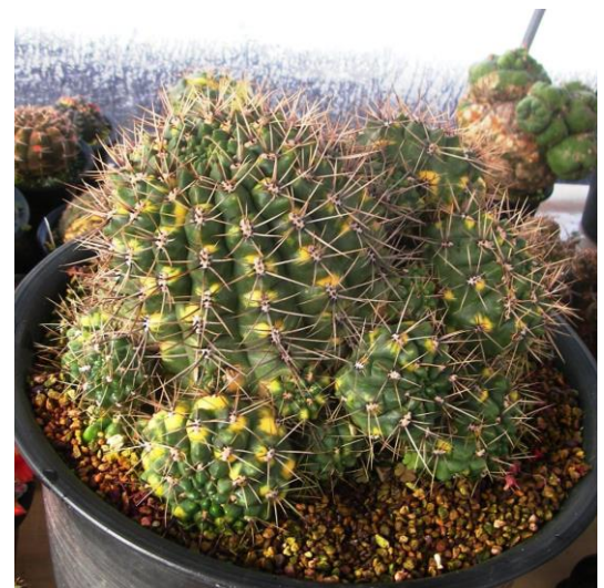
G. gibbosum varieg. (九紋竜錦)