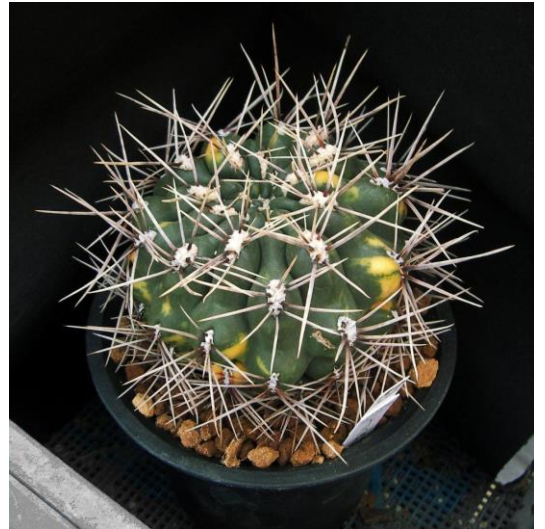
G. gibbosum varieg. (九紋竜錦)