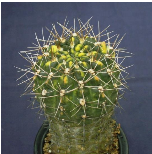
G. gibbosum varieg. (史進)