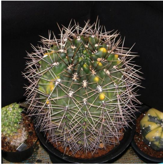
G. gibbosum varieg. (史進)