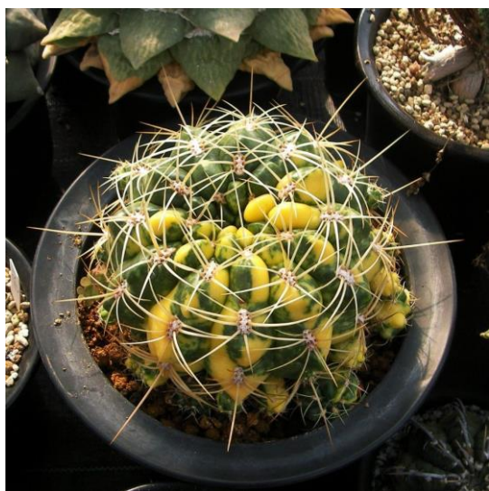
G. monvillei varieg. (モンビレイ錦)