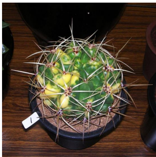
G. monvillei varieg. (モンビレイ錦)