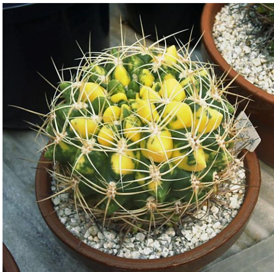
G. monvillei varieg. (モンビレイ錦)