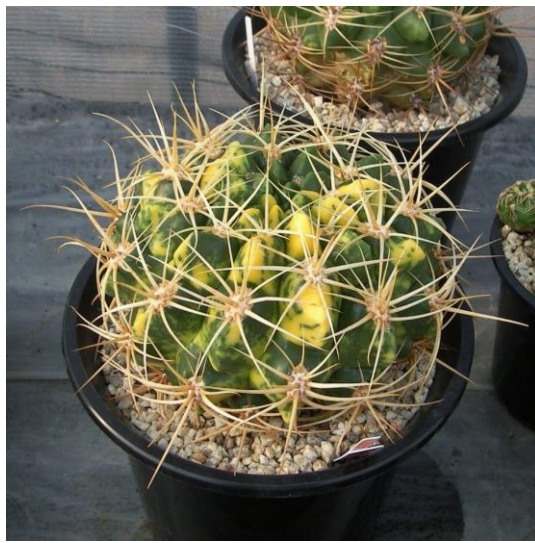
G. monvillei varieg. (モンビレイ錦)