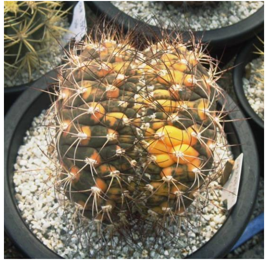
G. pflanzii v. albipulpa varieg.(天紫錦)