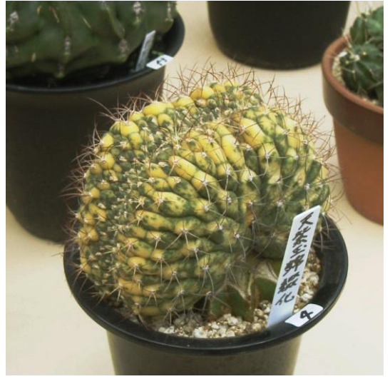
G. pflanzii v. albipulpa varieg.(天紫錦)