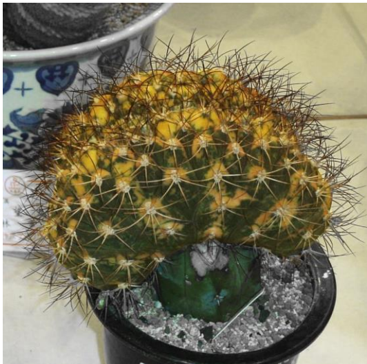
G. pflanzii v. albipulpa varieg.(天紫錦)