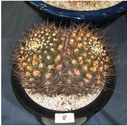
G. pflanzii v. albipulpa varieg.(天紫錦)