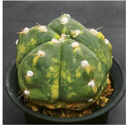
G. buenekeri varieg. ( 聖王錦 )