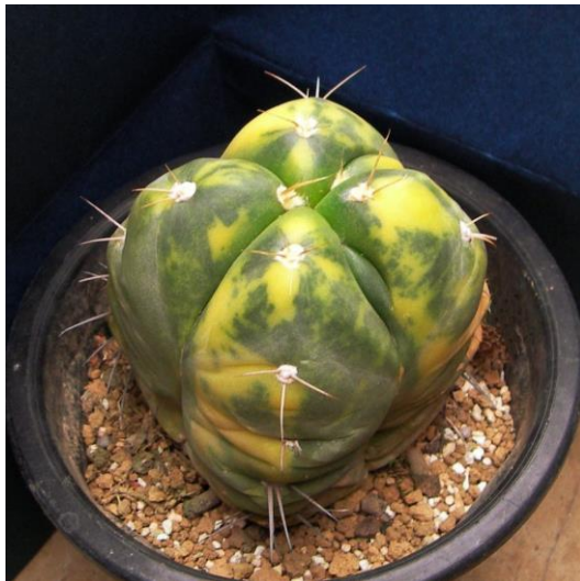
G. buenekeri varieg. ( 聖王錦 )