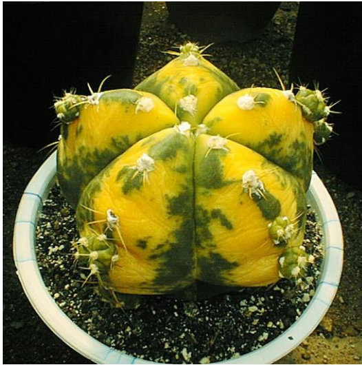
G. buenekeri varieg. ( 聖王錦 )