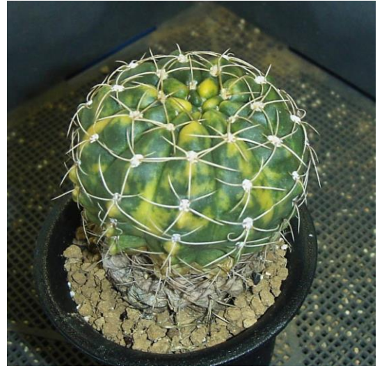
G. paraguayense aff. varieg. (モンビー錦)