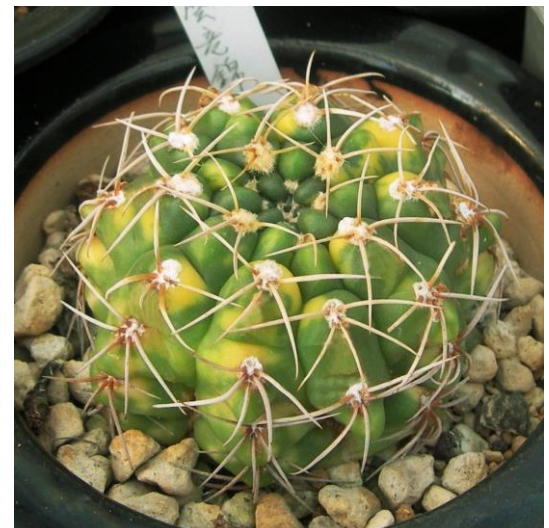
G. paraguayense aff. varieg. (雲竜錦)