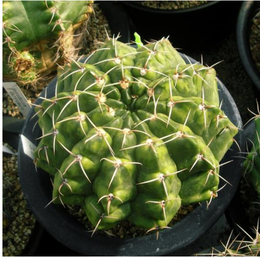
G. paraguayense aff. varieg. (モンビー錦(墨斑))