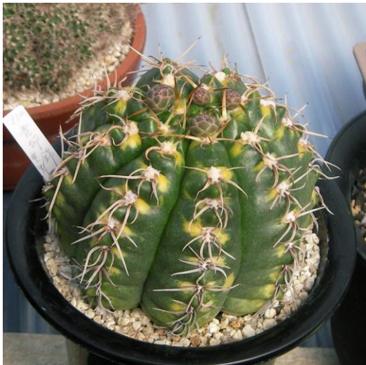
G. paraguayense aff. varieg. (竜卵錦)