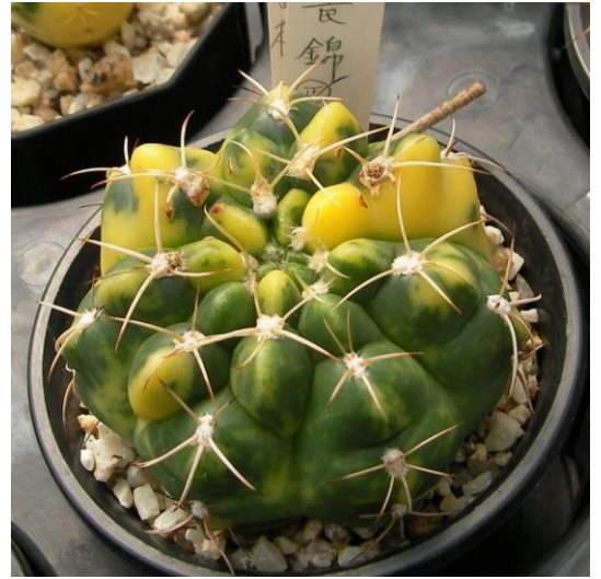
G. paraguayense aff. varieg. (雲竜錦)