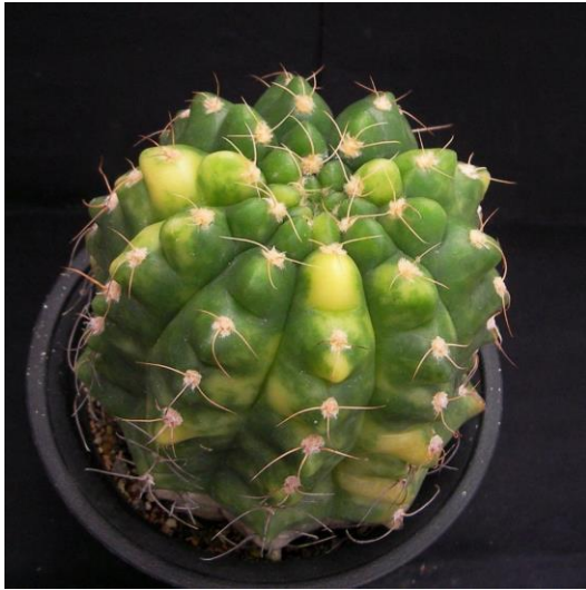
G. paraguayense aff. varieg. (モンビー錦)