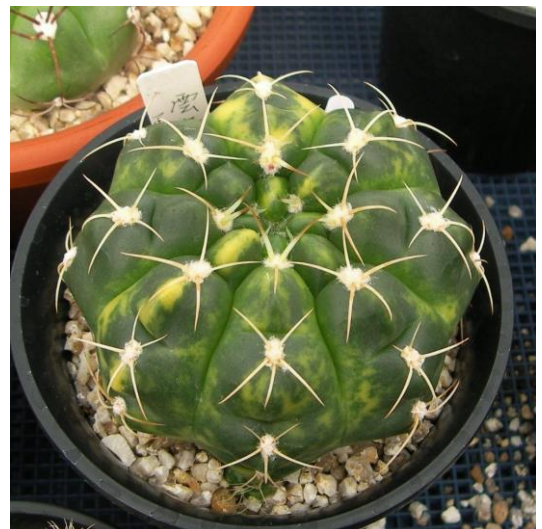
G. paraguayense aff. varieg. (雲竜錦)