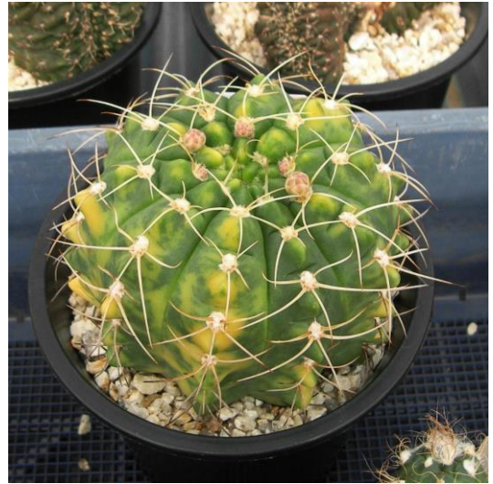
G. paraguayense aff. varieg. (モンビー錦)