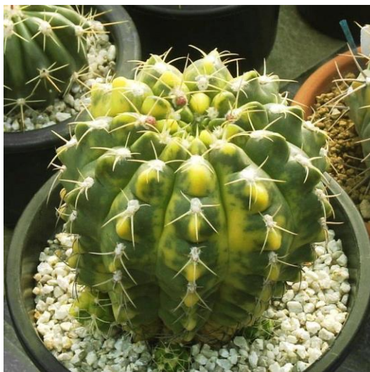
G. paraguayense aff. varieg. (雲竜錦)