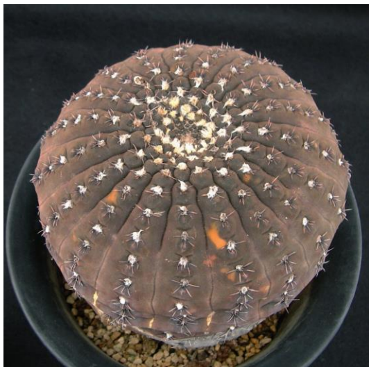
G. pseudoragonesei varieg. (プセウドラゴネシー錦)