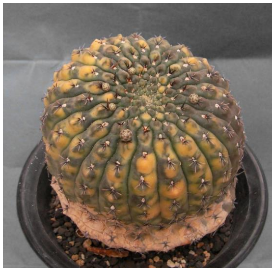
G. pseudoragonesei varieg. (プセウドラゴネシー錦)