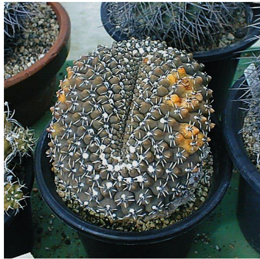
G. pseudoragonesei varieg. (プセウドラゴネシー錦)